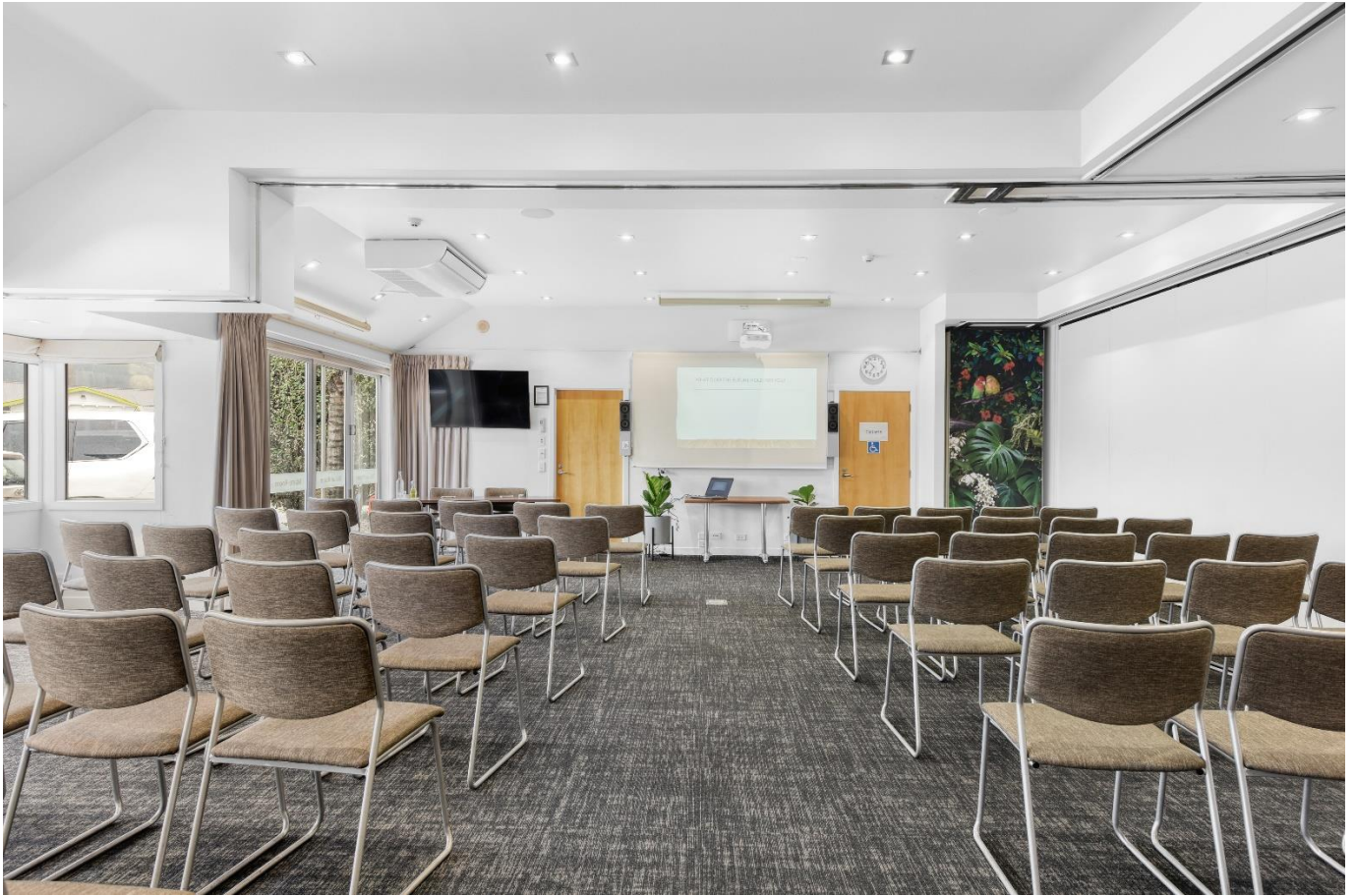
MOANA ROOM – EXAMPLE OF A THEATRE STYLE SET UP