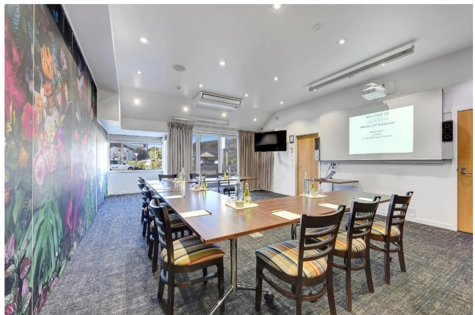
LORENZO ROOM – EXAMPLE OF A U-SHAPE SET UP