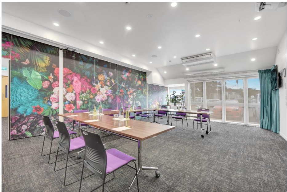
LORENZO ROOM – EXAMPLE OF A U-SHAPE SET UP